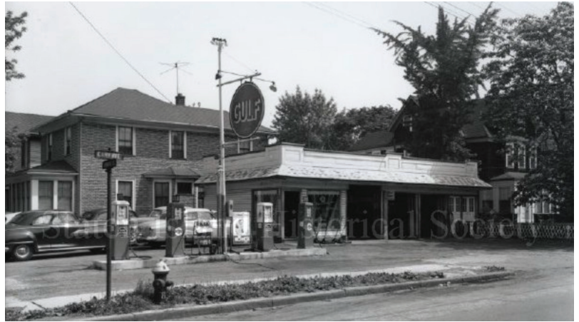
(photos courtesy of NYC Dept. of Records and S.I. Historical Society. Ad from the Advance)

seen alongside and behind the property still stand today but the trees are gone.