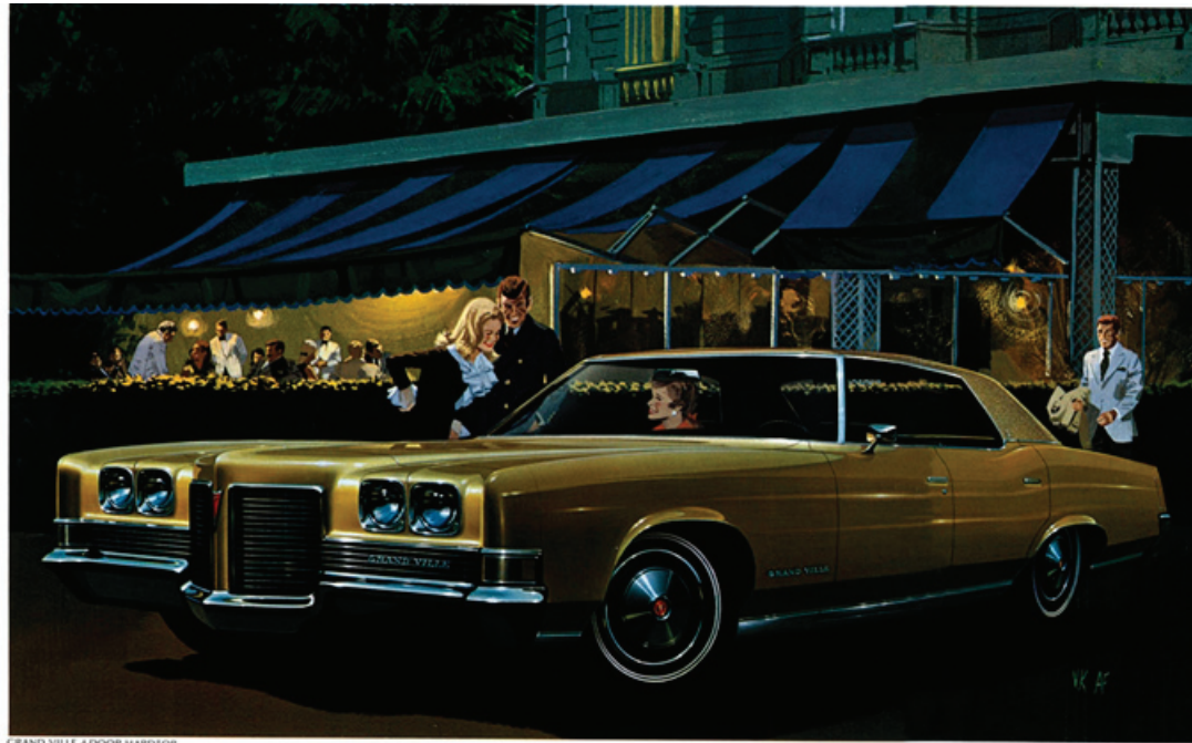
GRAND VILLE 4-DOOR HARDTOP

The car was moderately successful until all full-size cars fell out of favor during the oil crisis in 1973-74. 1975 saw the last Grand Ville's roll off the line, and 1976 brought the return of the Bonneville Brougham atop the Pontiac lineup.