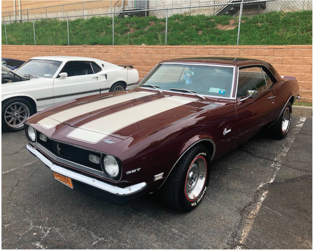
1968 Camaro also saw the switch from a circular to a rectangular side view mirror, and the placement of engine size emblems on the front of the fenders. Inside, much of the bright trimwork was changed to a brushed finish to reduce driver glare.