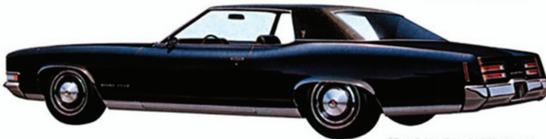
GRAND VILLE HARDTOP COUPE

Did you know? 1971 was a year of shifting names at Pontiac. Catalina remained the base trim, but the outgoing Executive series became the Catalina Brougham. The Executive line replaced Star Chief in 1967.