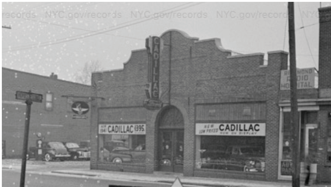
Eagle-eyed readers might notice an oval Ford script just below the big Cadillac sign on the front of Cornell Motors (above). The adjacent service building seen below is now home to a laundry and nail salon, while the showroom is now a deli. In the old ad at bottom left, the vertical chrome strips on the rear fender are the tell-tale signature of the Fleetwood Sixty Special.

Our first stop back in time is in 1940, outside the Cornell Motor Car Company, a Cadillac dealer located at 438 Richmond Avenue (which is now 438 Port Richmond Avenue, at right). Jumping ahead to April 14, 1953 the dealer is now called Hosler Cadillac, and we are glimpsing their corner lot at Burden Avenue, where they still promise to service your old LaSalle. Before heading back to 2020, we dialed in November 16, 1959 to pick up a copy of the Staten Island Advance to find this ad from Hosler highlighting the new 1960 Fleetwood Sixty Special. This dealership eventually became Crest Cadillac (the earliest reference we can find to that name is 1968).