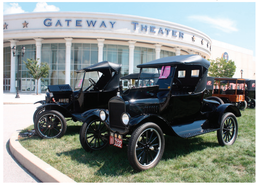
1920's T's and early 90's sports models show the range of our hobby.