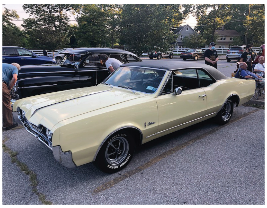
Our President and Vice President now each own a 1967 Olds Cutlass..