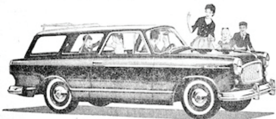
1960 Rambler American Custom 2-Door Station Wagon.

So hurry in while we still have a good choice of smart, double-useful station wagons—the world's best sellers in the 6-cylinder field. Don't delay. Prices of big used cars are plummeting—waiting may cost you hundreds of dollars. Buy today and save big money. Get a quality-built Rambler with proved top resale value.