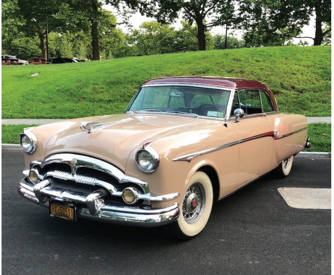
The Mayfair was Packard's entry into the popular two-door hardtop market that developed after WWII. A two-door hardtop has no post, or b-pillar, to divide the side window from the rear quarter window.