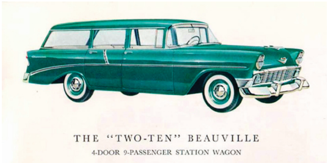
THE "TWO-TEN" BEAUVILLE 4-DOOR 9-PASSENGER STATION WAGON

Identifying the remains of four cars featured inside the newsletter, starting from top left and working clockwise: 1963 Chevrolet (based on the headlight/parking light configuration); 1956 Chevrolet 210 wagon (based on original brochure image at right); 1970-72 Olds Cutlass (the taillights would allow us to pinpoint the year); 1961 Chevrolet Bel Air (the Impala had six lights across the rear, not four. Can't be a Biscayne because it has chrome trim on trunk lid).