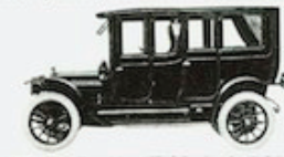
1912—The Rambler "Knickerbocker" Limousine carried seven passengers, sold for $4,200.