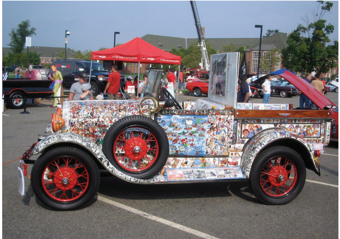
Eagle eyed readers may notice we also had a certain crime fighter's car on hand in 2008 as well.

The SIRAACA Archive is a treasure trove of old photos, articles and artifacts that represent our club's history dating back to our founding in 1974. These are not centrally collected, but in the hands of the many members past and present. If you have something from the past that you'd like to share here, let us know.