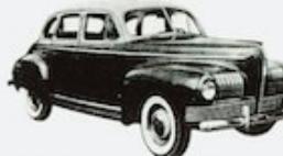
1941—The greatest basic improvement in 40 years, Nash Airflyte body-and-frame.