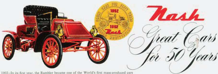
1902—In its first year, the Rambler became one of the World's first mass-produced cars

Bus trip invitation for SIRAACA members.