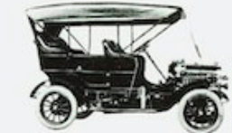
1907—This $2,500 model seated five, weighed 2600 pounds, had a 40-horsepower engine.