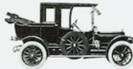
1911—The smart Rambler Landulet was one of the early "convertibles".