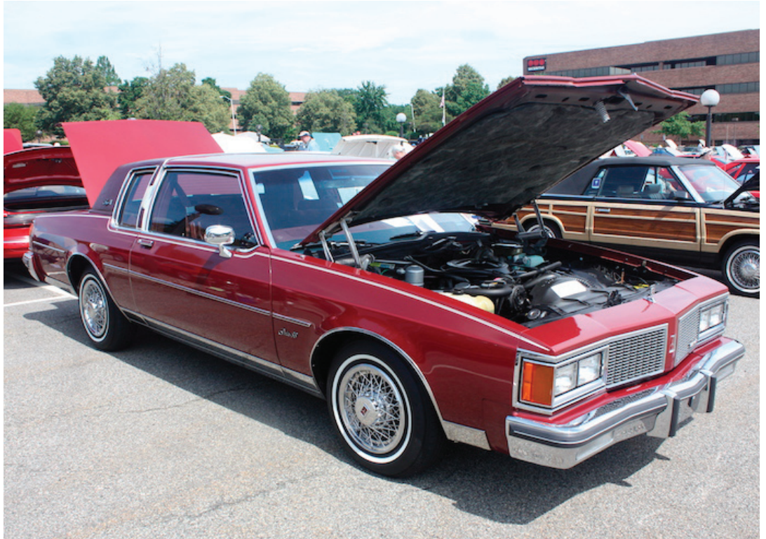
As Dick Van Patten said in a 1984 TV ad, the Olds 88 is "the family car that didn't forget the family".