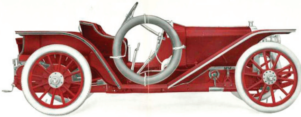
The American Roadster Two or Three Passengers. Four Cylinder, 36-48 H. P., $3,750

A newly minted national winner in the SIRAACA Garage