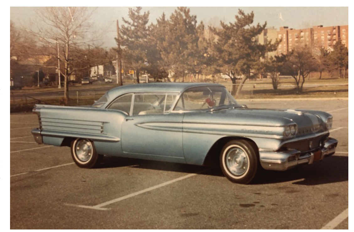
Oldsmobile introduced the 88 badge in 1949. By 1951, the 88 was the entry-level Olds In 1958, Oldsmobile was ranked number four in US production, trailing Chevrolet, Ford and Plymouth, and atop GM siblings Buick amd Pontiac.