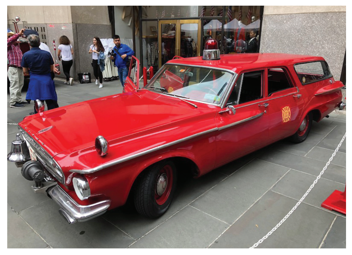
The 1962 Dodge Dart FDNY wagon was spotted recently on display in Rockefeller Center.