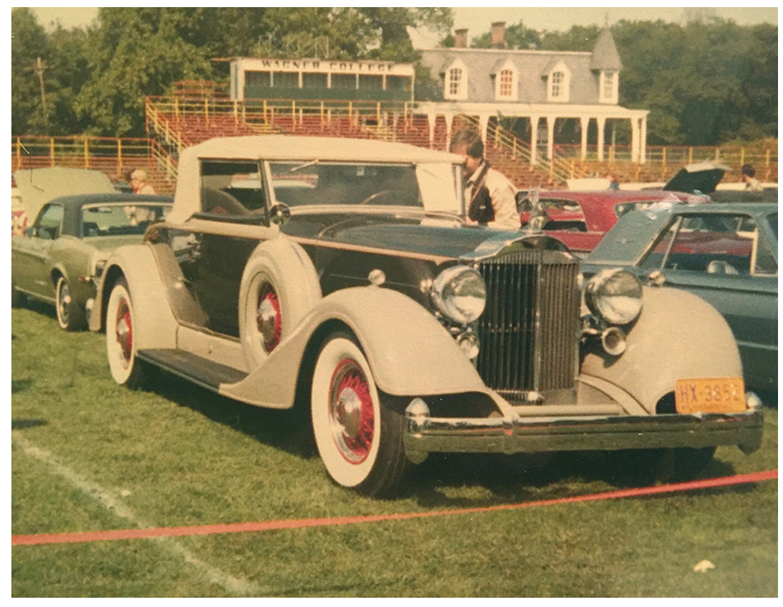
When 30's cars were the equivalent of 70's muscle cars today. (photo credit unknown)