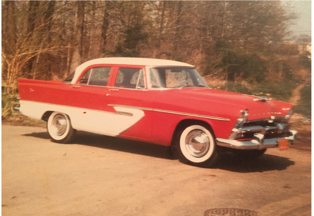
The Belvedere name originated as the designation of a two door hardtop on the Plymouth Cranbrook in 1951. In 1954, it replaced the Cranbrook as the top of the line Plymouth.