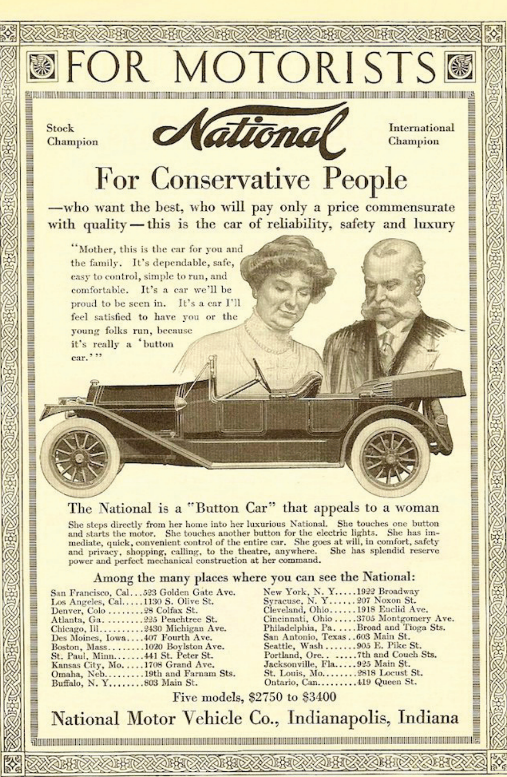
THE OUTLOOK ADVERTISING SECTION