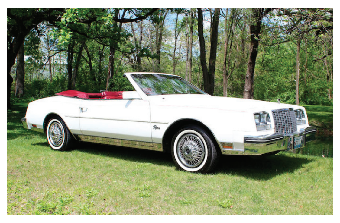
1982 Riviera convertibles came in either White or Red Firemist, with Claret or Maple interriors. Claret is dark red, Maple is light brown.