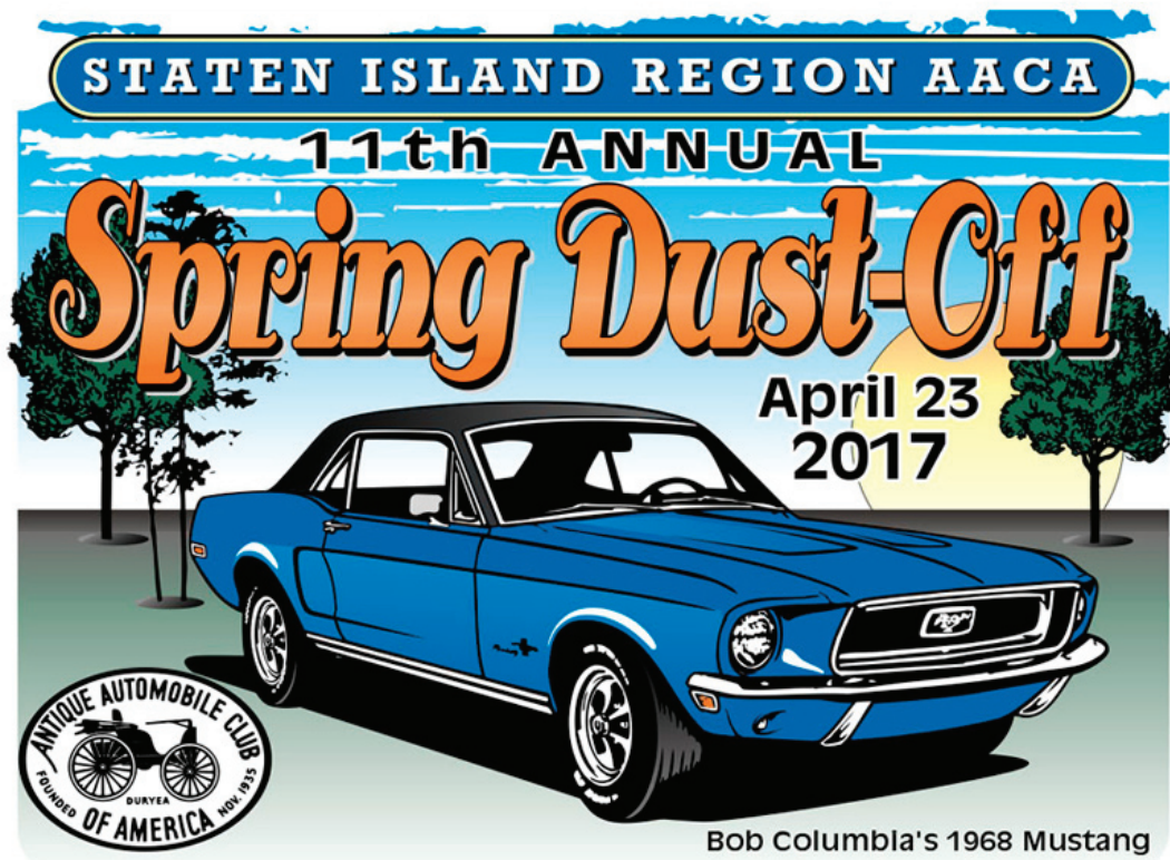
2017 Spring Dust-Off plaque produced by Daytona Trophy.