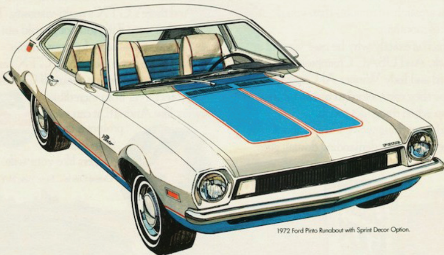
1972 Ford Pinto Runabout with Sprint Decor Option.

If you find yourself staring whenever you see a Model "T" go by, we don't blame you. It was some kind of car. (Even if it did come mostly in black.) It was simple. It was tough. And if something went wrong, you could probably fix it with a screwdriver and a pair of pliers.