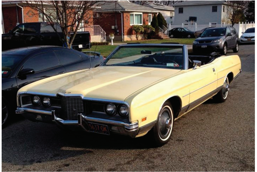
While Ford had some inventive color names in 1971, such as "Anti-Establish Mint", "Walnut Fire", and "Grabber Lime", their marketing folks couldn't nail them all. As best we can tell, Artie's LTD is "Yellow".