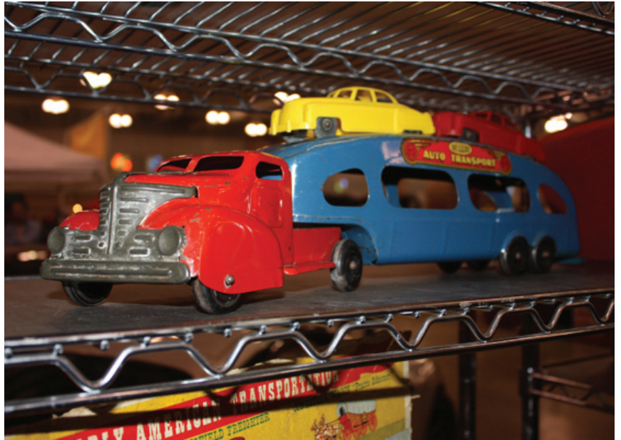
Although the number of cars for sale and vendors on hand has dropped each year, you'll still find a few that continually impress each year. If you head to the Auction at Atlantic City, look for vintage toys like the 1940's auto carrier above, or low-mileage originals like the 1982 Pontiac Grand Prix with 9,000 on its odometer, below.