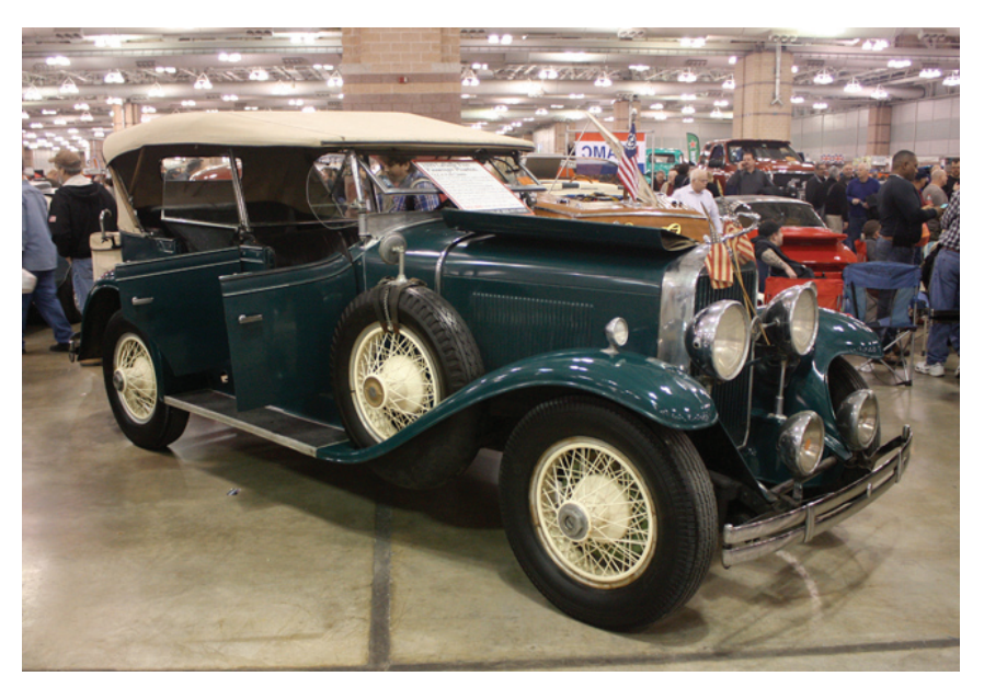
One of the few 1920's cars for sale in AC was this 1929 LaSalle Series 328 fivepassenger phaeton (above). It was a good, solid example of either a wellpreserved original car or a not-so-well-preserved older restoration. Either way, the owner was asking for $42,900. The 1978 Lincoln Town Car (below) was a Cartier Edition with only 9,282 original miles. It was a no-sale at a high bid of $9,750, or slightly more than $1.00 per mile.