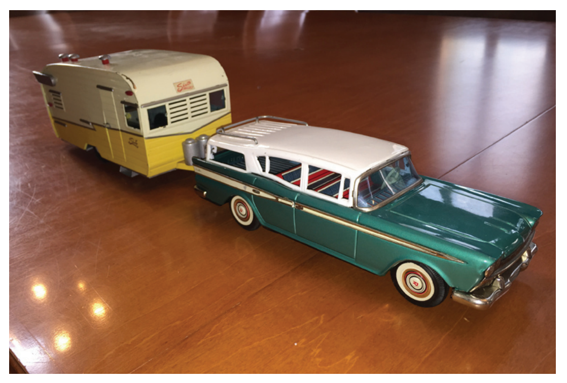
There was an exact duplicate of this combo that recently sold on eBay, but the selling price was negotiated outside of the auction and is not known. Other Bandai models of 1959 autos can be found on eBay, with their Cadillac sedans and convertibles the most popular listings. Prices run across a wide range depending on condition, color and inclusion original box.