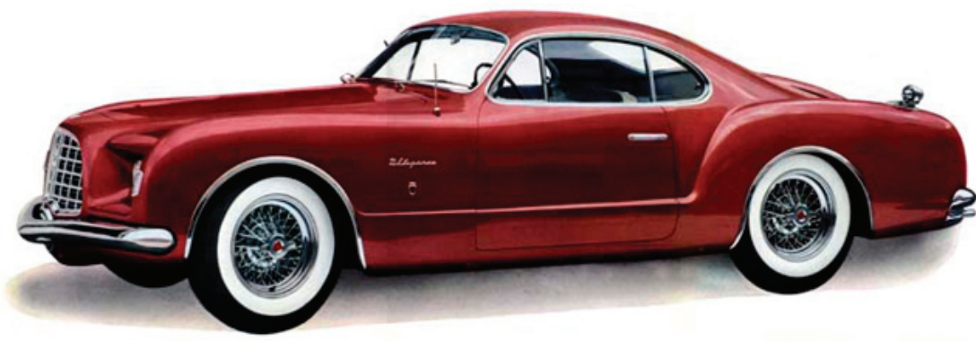
To see how different these custom designed Chryslers were from their 1952 production counterparts, here's an Imperial from that year.