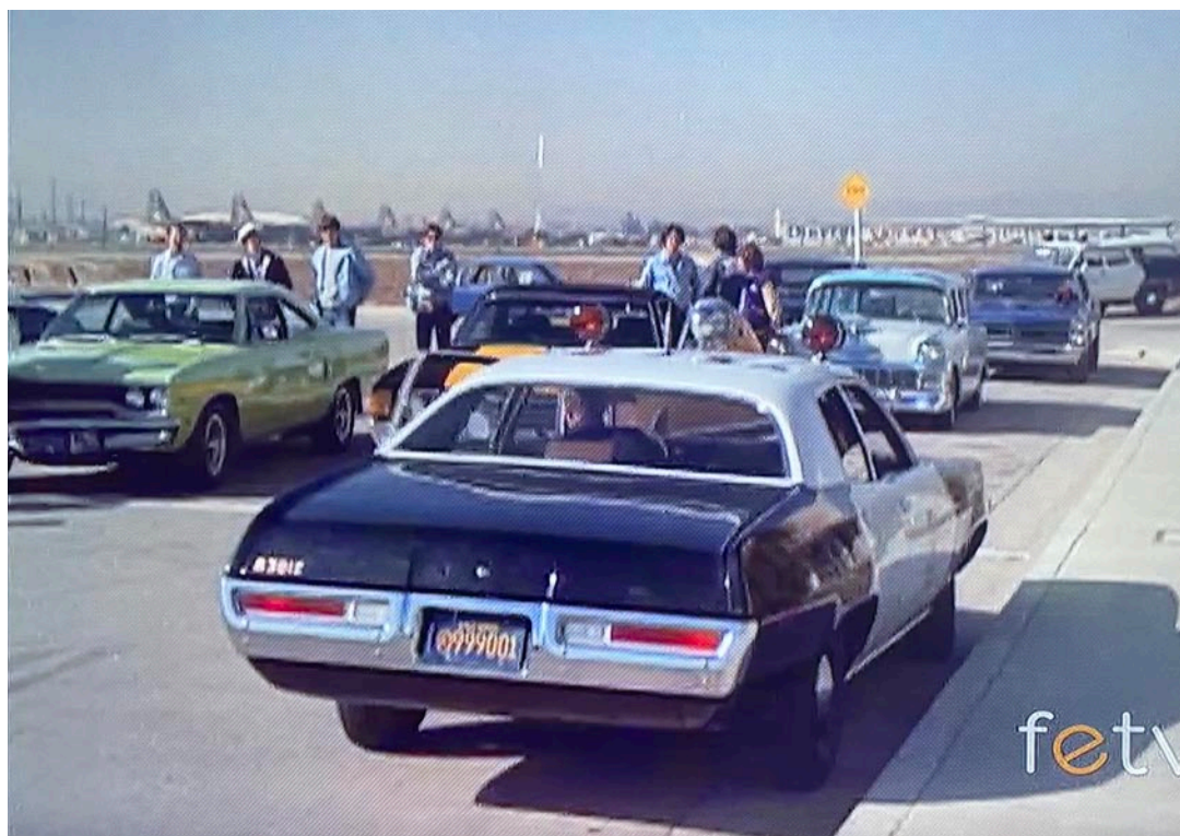
Adam-12 went through a number of police cars during its run, starting with a 1967 Belvedere in the pilot episode. They ran with various Plymouths through 1971, and then switched to AMC Matadors until the show ended in 1973.

Most old TV shows will typically have outdoor scenes, providing car spotting opportunities. Some shows are better than other, and some hit the jackpot based on the particular episode. Such is the case with an episode of Adam-12 from 1972 entitled "Who Won?" (S.4 Ep.22). In it, Officers Reed and Malloy work to get local car clubs to move street racing to a drag strip, and it features plenty of period muscle cars and hot rods. One scene (picture below) features the Plymouth Adam-12 car roll up on a Limelight Green 1970 Road Runner lined up against an orange and black 1972 El Camino. Behind them are a 1956 Chevy wagon and a 1965 GTO. Other scenes feature Reed working on his 1954 Ford, and then racing a 1968 Camaro at the dragstrip. The acting might be a bit corny in retrospect, but the cars are definitely cool.