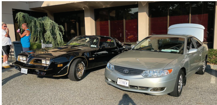
Left: A pair of cars on display, one well-known, another uncommon. Next to the "bandit" Trans Am is a 2002 Toyota Solara. The owner has it since new, as evidenced by the license plate GOTRNEW. Despite having more than 140,000 miles on its odometer, it was in excellent shape. It was the owner's first time doing something with the hobby here on the Island, yet he was familiar with cruise nights such as Somerville. We suggested he check out Sunday mornings in Great Kills.