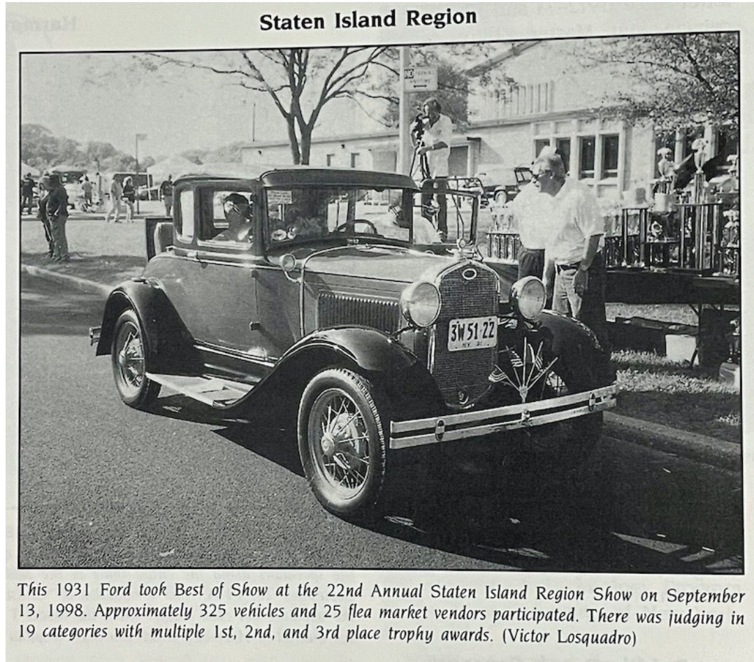
This 1931 Ford took Best of Show at the 22nd Annual Staten Island Region Show on September 13, 1998. Approximately 325 vehicles and 25 flea market vendors participated. There was judging in 19 categories with multiple 1st, 2nd, and 3rd place trophy awards. (Victor Losquadro)