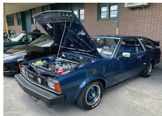
At right, a 1981 Toyota Corolla SR-5, one of the more unique entries among the vehicles that attended the 10th Annual New Dorp High School car show on June 1. It was selected as one of the Top 50 Award winners by a team of SIRAACA judges