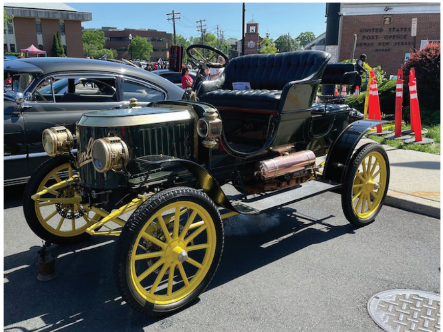
Two vehicles that stood out among the hundreds of restomods were this 1908 Stanley Steamer (above) and beautifully restored 1978 Ford F-350 tow truck (below).

Despite gusting winds all day long, sunny skies drew more than 600 cars to the center of Rahway, NJ for its annual Hot Rods & Harleys event. SIRAACA was on hand in force to sell raffles on our 2007 Mustang as well as judge 36 classes of cars ranging from a 1908 Stanley Steamer (photo below) to brand new Corvettes. Attendees enjoyed live music across multiple stages throughout town, and countless options for food from local restaurants and food trucks. The organizers of the event donated $1000 to our club in return for the help in judging, and the raffle car took in $1,465 that day. Thanks to all who pitched in across all fronts.