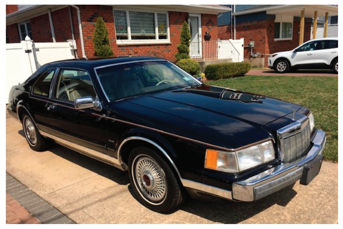
The 1988 Lincoln Mark VII brochure indicates that the Bill Blass Edition came in a choice of seven colors. Artie's is painted Midnight Black Clearcoat, one of only two non-metallic shades (the other is Arctic White). An early color offering called Crystal Clearcoat Metallic was replaced later in the run by Silver Frost Clearcoat Metallic.