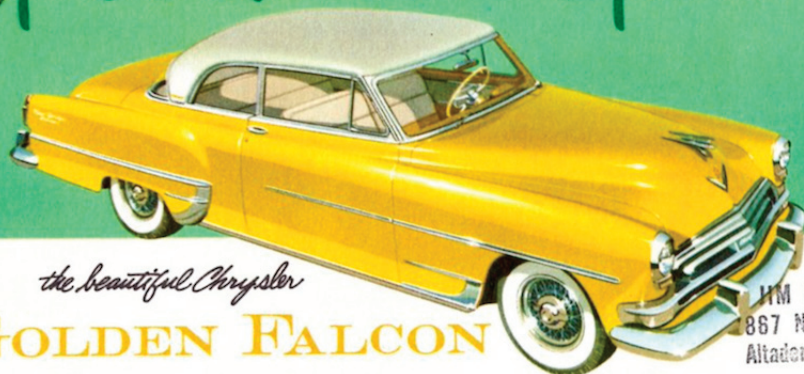
the beautiful Chrysler GOLDEN FALCON