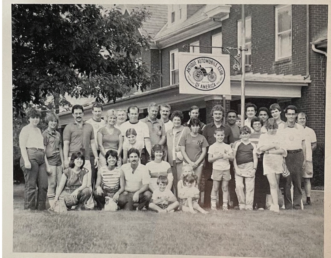
AACA Staten Island Region members at National Headquarters.