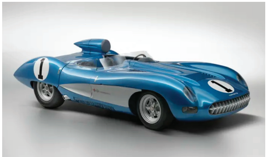
This was the first purpose-built GM factory racecar. It is powered by a Chevrolet 283 with Ramjet fuel injection, and features lightweight magnesium bodywork. Unfortunately, the body conducted heat directly into the cockpit, and the drivers could not bear the high temperatures.

Project XP-64. Sound familiar? Unless you are a Corvette enthusiast, you may not know what it is. Soon enough, however, it will be the talk of the hobby. Why? Because XP-64 is a one of a kind factory race car, officially known as the Corvette SS. It was built by Zora Arkus-Duntov and competed in the 12 Hours of Sebring in 1957. Getting ready to then go on to the 24 Hours of LeMans, the Automobile Manufacturers Association ordered an end to factory racing, and GM complied. Zora saved the car from the crusher, moved it around for a few years and then gave it to the Indianapolis Motor Speedway Museum, where it has sat for most of the last 58 years. RM Sothebys will sell the car for the first time in Miami this month with an estimated price of $5-7 million. We think more.