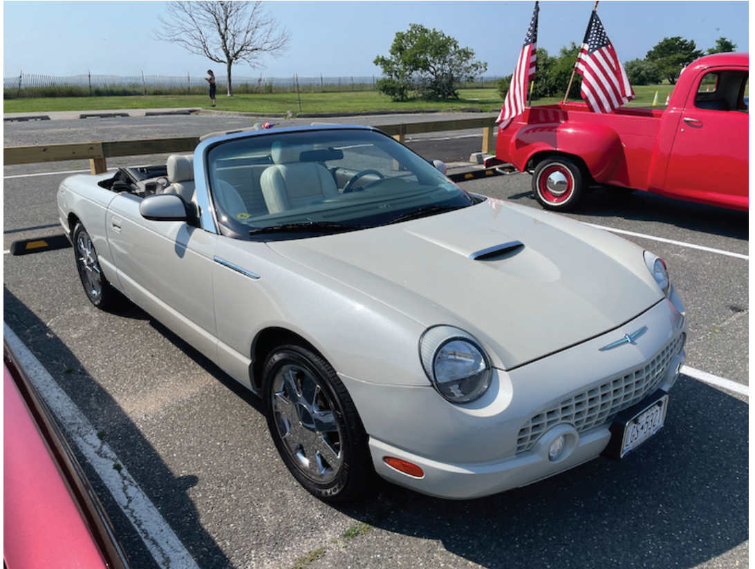
2005 T-Birds came in seven colors. With a low overall production total, each color is relatively limited: Torch Red (1846 total), Evening Black (1713), Cashmere (1500), Medium Steel Blue (1463), Bronze (1396), Platinum Silver (1295) and Inca Gold (82).

The SIRAACA Garage is home to all of our members' cars, past and present. Has your car been featured yet? Make sure you get the details to Paul Jr. if you want to share your car with us all.