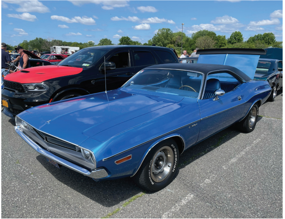
This is where I usually add another fact or two about the feature car. This one happens to have its trunk left open.