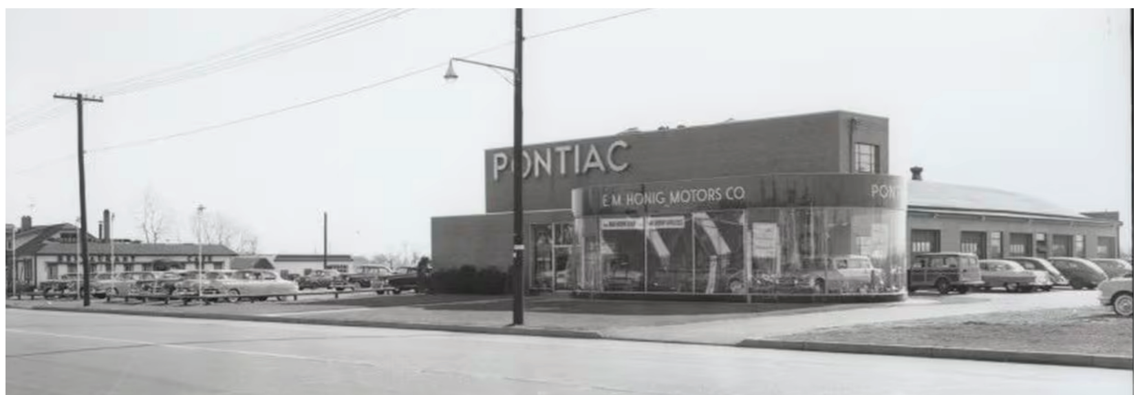
Top photo courtesy of the NYC Municipal Archives. Center photo courtesy of the Staten Island Historical Society, taken by Herbert Flamm. Bottom photo courtesy of the Museum of the City of New York, taken by Harvey Wang.