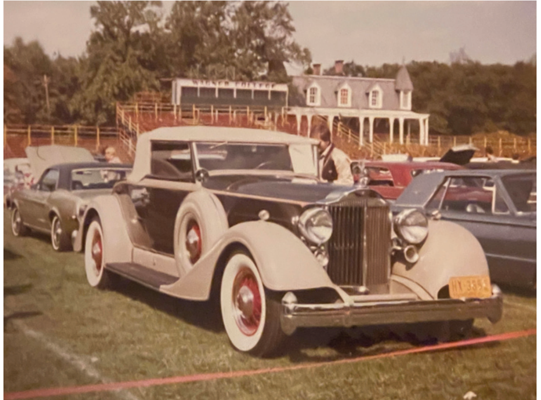
Our initial show on the football field at Wagner College was in 1979, following our first two shows held at the Academy of St. Dorothy on Hylan Boulevard. Note the red tape running along the front of the car. At our early shows, we actually "roped off" the cars from the spectators after they were in place on the show field.