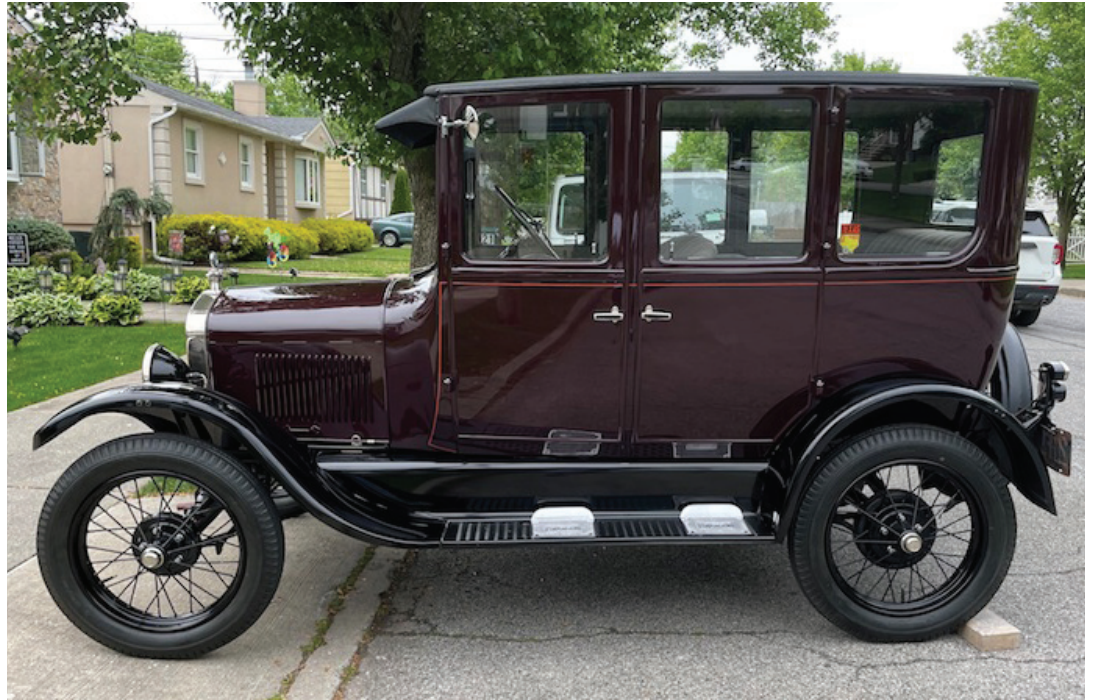
Welded wire wheels were offered as an option on the Model T beginning in January of 1926. Standard color for these wheels was black. That year also saw various designs of the headlight tie bar and mounting locations for the lamps, which were painted black with nickel trim. A nickel radiator shell was optional.