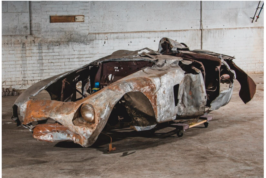
This is the second Mondial built and one of 13 examples originally completed with Pinin Farina coachwork. It raced in the Mille Miglia, Targa Florio and Imola Grand Prix.

The month of August sees the hobby's attention look to Monterey for a week of events built around the Pebble Beach Concours. Tours, gatherings and auctions dominate the California peninsula, bringing well-heeled collectors with deep pockets together to show and buy some very serious automobiles. RM Sotheby's typically serves up multi-million dollar Ferraris and other exotic sports cars with a side order of classics. Their most amazing offering is a 1954 Ferrari 500 Mondial Spider. It's a pedigreed race car that was completely wrecked and burned in the early 1960's. The crumpled body, a matching number gearbox and rear axle are bundled for sale with a Ferrari engine, estimated to fetch as much as $1.6 million (see more photos in RM's digital catalog at rmsothebys.com ). All but three cars offered in this auction are expected to sell for at least six figures, with three more estimated to hit eight figure price tags.