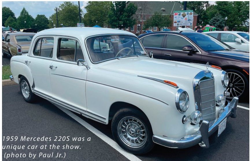
1959 Mercedes 220S was a unique car at the show.