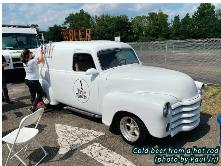
Cold beer from a hot rod