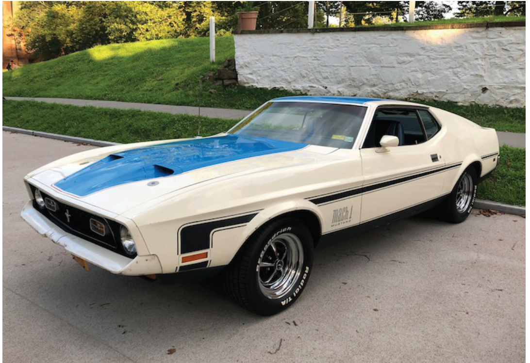
The standard engine for the 1971 Mach 1 was a 302, but three optional 351's were available - 2bbl, 4bbl or the R-Code 351HO.