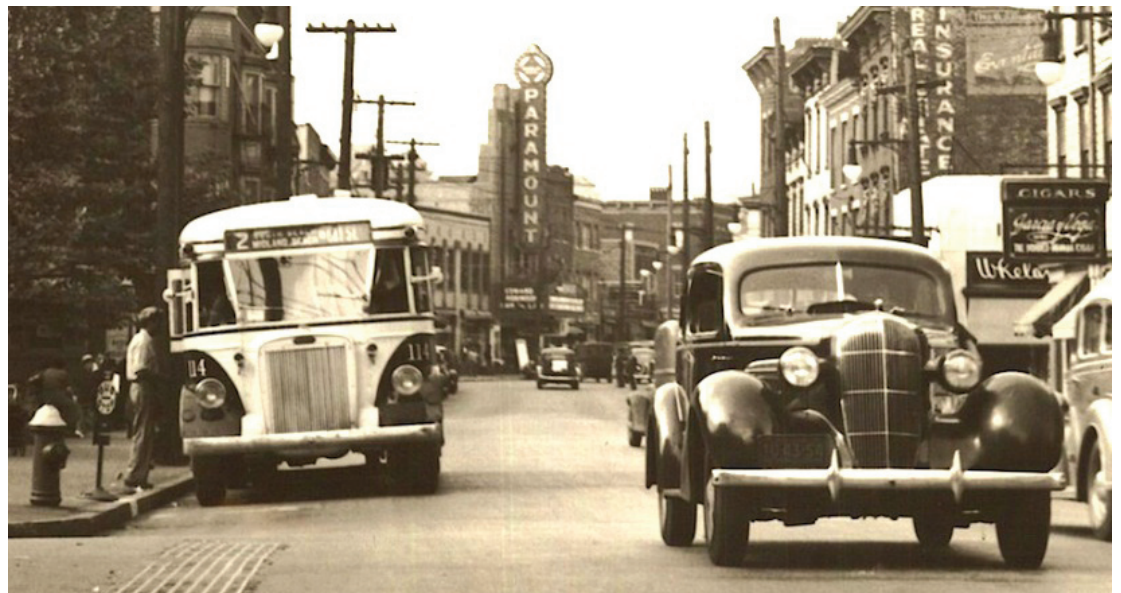
Corner of Canal and Bay Streets, 1938. Bus is a circa 1934 ACF, which is short for American Car and Foundry.