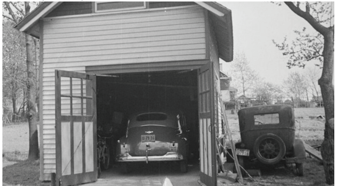
Garage on Arthur Kill Road near Richmond Town, taken in 1941. Brand new car knocks the old one out of the garage.