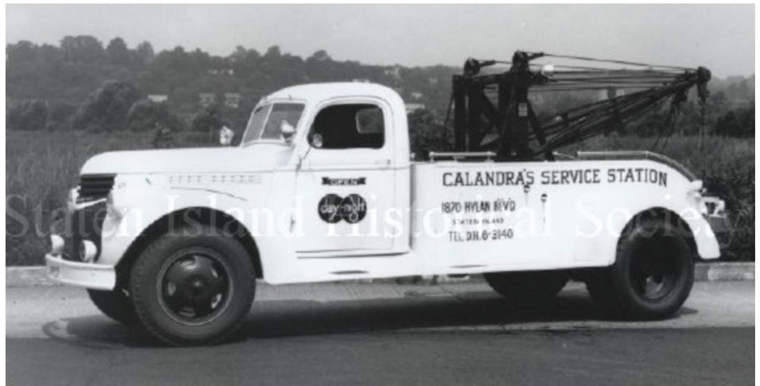
Above, new for 1941 styling introduced a two layered grille and streamlined headlight pods mounted atop the front fenders. Below, notice undeveloped land as far as you can see behind the station.

Knowing where and how far back to go with the SIRAACA Time Machine usually starts with a business name or address. In this case, we targeted a current Citgo gas station and My Mechanic repair shop at 1870 Hylan Boulevard on the corner of Slater Boulevard. Sure enough, it was a Gulf gas station and repair shop long ago, too. We zapped ourselves back to that location circa 1940, for a view of the premises. While it wasn't parked there when we passed by, we eventually came across their wrecker, what appears to be a 1941 Chevrolet. The image on the truck's door features a banner up top with the word "OPEN" and two overlapping circles saying "day" and "night". Calandra's must have been relatively new at that time, since there is no mention of it in a 1933-34 directory of Staten Island businesses. That directory lists plenty of automotive garages and gas stations, which we hope will continue to point our SIRAACA Time Machine in the right direction for many months to come. We've also figured out how to safely travel back in time even further than our typical jumps, so keep an eye out for those soon.