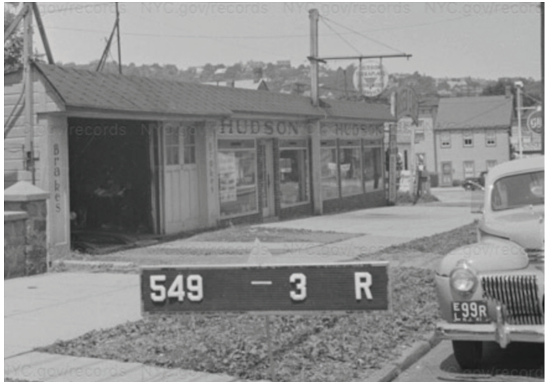
License plates date these photos from 1941 (above) and 1950 (below). Members are asked to identify the cars, with answers provided next month.

Taking a cue from the 1940 telephone directory, we dialed in to visit Dinkel Motors, a Hudson dealer on a since demolished area near Cedar Street with an address of 50 Tompkins Avenue. Passing by in 1941 (top photo), we notice some signs of life, at least in that the garage bay is open. Passing by again in 1950, we see what looks to be an unused location. Note the weeds growing in front of the garage doors by then. Oddly enough, a nice Hudson sign was installed sometime after 1941, with a fate unknown as the 1950's rolled around. This stretch between Broad and Hill was razed to make way for the Stapleton Houses and its adjacent playground when work began in 1959. We couldn't find much about Dinkel other than references to Hudson advertising of dealers in 1935. We're disappointed that our DeLorean Time Machine isn't a pickup truck or box van. We'd love to load it up with plenty of goodies like that sign and who knows what else might have been left behind in that building. In the meantime, try and identify the two cars. One hint - each of them would qualify for a "Best Orphan" at our Spring Dust-Off.