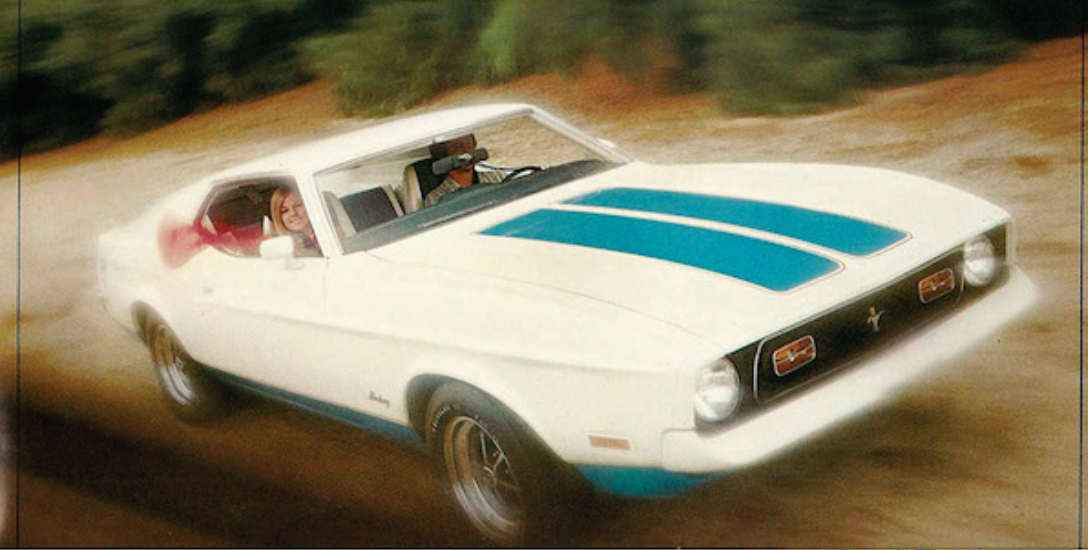
Ford Pintos, Mavericks, Mustangs—Now in colorful new Sprint editions for spring.

America's favorite threesome all dressed up with special red, white and blue paint and interior to match! Sporty extras like dual racing mirrors, blackout grille. Racy striping along the sheetmetal. A special USA shield. Bright trim rings, whitewalls, color-keyed hub caps. Even competition suspension, chrome mags and raised lettered wide oval, if you like, on Mustang. New sports packages for just a little more than you'd pay for a basic Ford Pinto, Maverick or Mustang. Join your Ford Dealer's all-American salute to savings this spring. Put a little Sprint in your life!