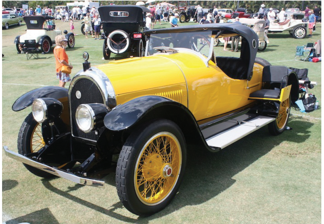
The Kissel Kar Klub knows of 150 or so complete Kissel cars, trucks and funeral vehicles dating from 1908 to 1930, making them rarer than a Deussen Model J.