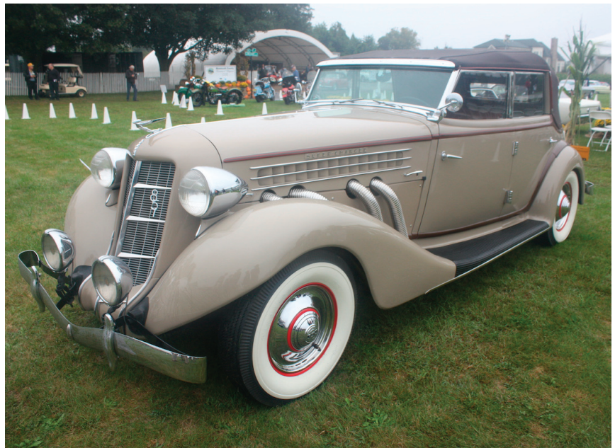
Auburn's supercharged straight-eight generated 150 horsepower.

The New Jersey Chapter of the Buick Club of America is rescheduling its annual show to July 16 on the grounds of the Wall Township Municipal Complex at 2700 Allaire Road in Wall, NJ. The show is open to all makes and models, not only Buicks, with eleven judged classes and peer judging for newer cars. Awards include the top three vehicles in each class plus a Best Buick award and Best in Show award. Vehicle admission is $20, and the show runs from 9:00 until 2:00. The original date of July 9 was postponed due to uncertain weather. Contact Kevin Keenan if you have any questions or want more information, on 908-461-8301 or email him via kkcarcrazy@aol.com .