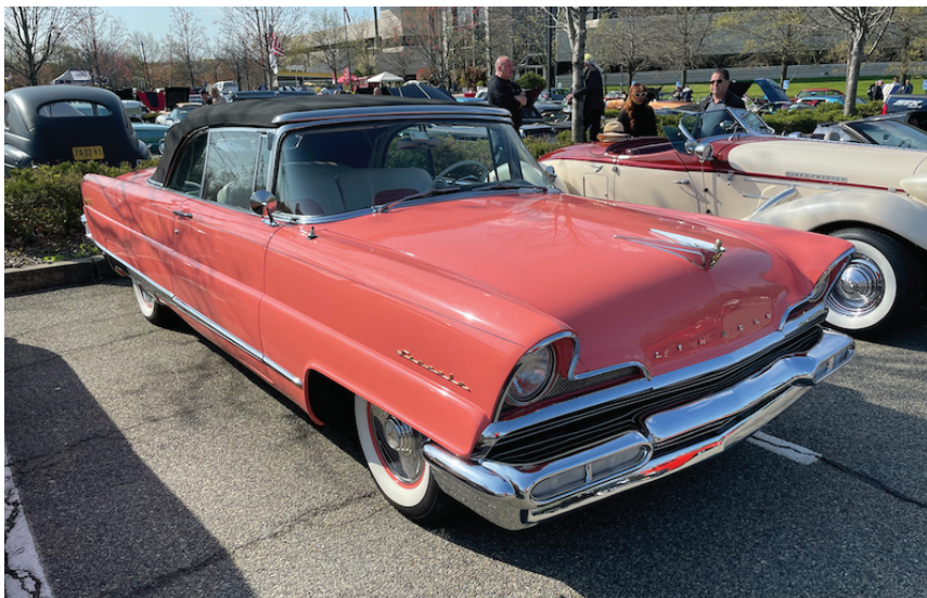
'56 Lincoln, Best in Show, Post-War. '72 Corolla, Best Foreign Car.