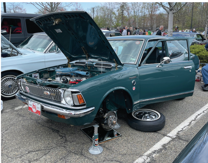
Below: 1970's Pray Auburn 866, winner of Best Orphan