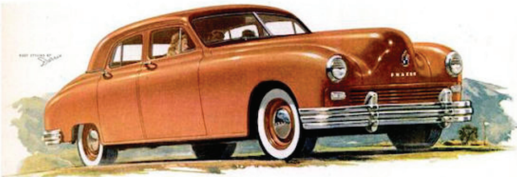
KAISER-FRAZER CORPORATION GRAHAM-PAIGE MOTORS CORPORATION WILLOW RUN, MICHIGAN