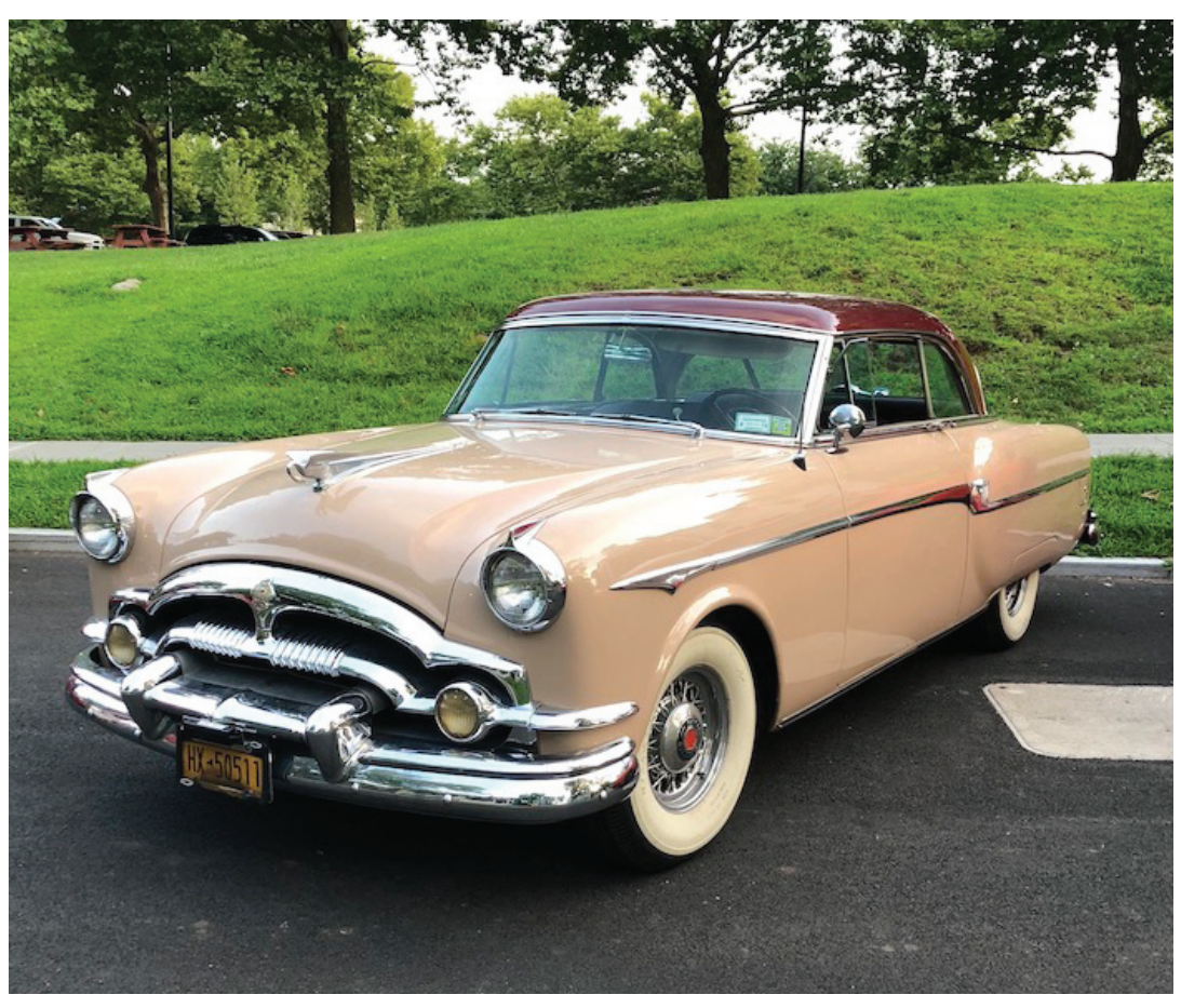
The Mayfair was Packard's entry into the popular two-door hardtop market that developed after WWII. A two-door hardtop has no post, or b-pillar, to divide the side window from the rear quarter window.