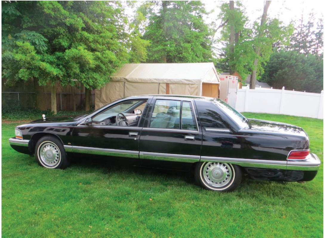
The 1996 Roadmaster was the final year of the second coming of the nameplate, which began in 1991. The first run lasted from 1936 through 1958.