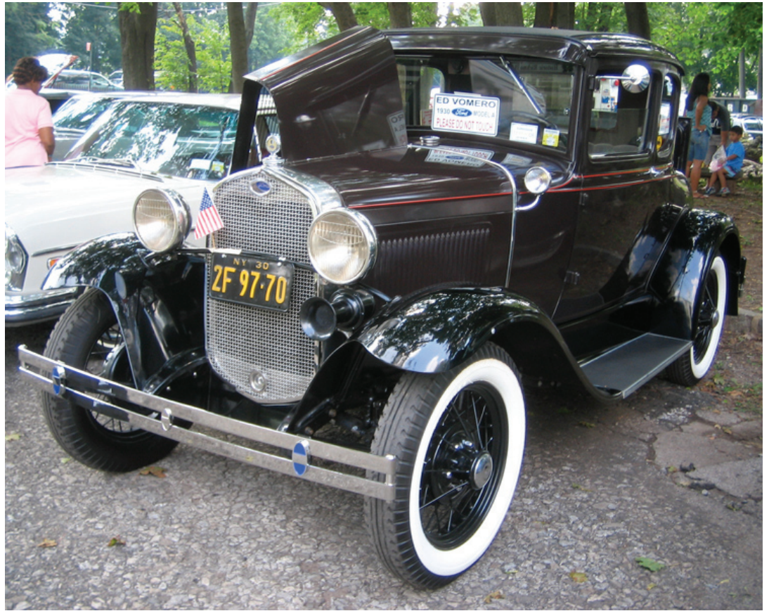
The 1930 Deluxe Coupe cost $545 if the buyer picked it up at the factory.