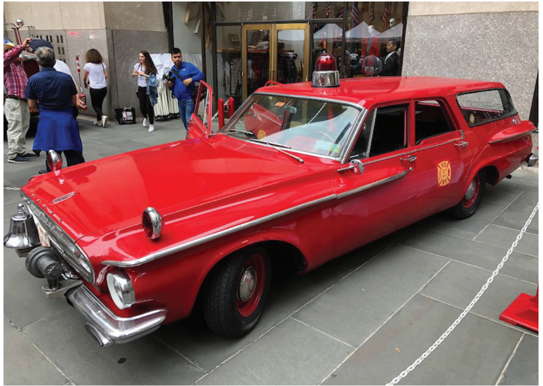
The 1962 Dodge Dart FDNY wagon was spotted recently on display in Rockefeller Center.