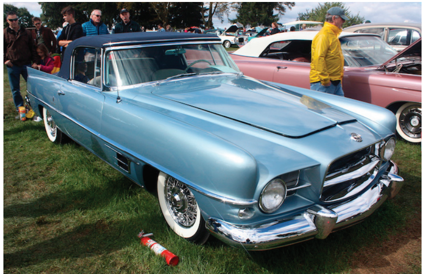
Above: 'This 1957 Dual Ghia won a First Junior award in Class 29, for specified prestige vehicles. The only cars to fit below were these BMW Isettas.