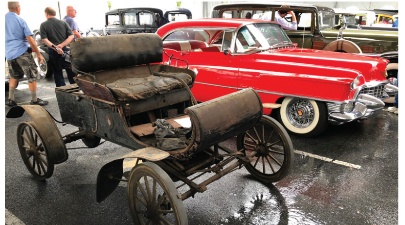
What a difference 50 or so years made when it came to the first half of the 20th century

American classics are always front and center at RM Sotheby's Hershey Auction, unlike the Ferrari-fest over at Pebble Beach. Many cars blew through their estimates. A 1912 Baker Electric sold for $192,500 against its $100,000 pre-sale figure, and a 1911 American Eagle Touring saw multiple bidders battle it out for ownership. In the end it sold for $242,000, triple its estimate of $80,000. Our favorite was a 1960 Fury convertible with a dual four-barrel Cross Ram "Sonoramic Commando" V8, which went for $209,000.