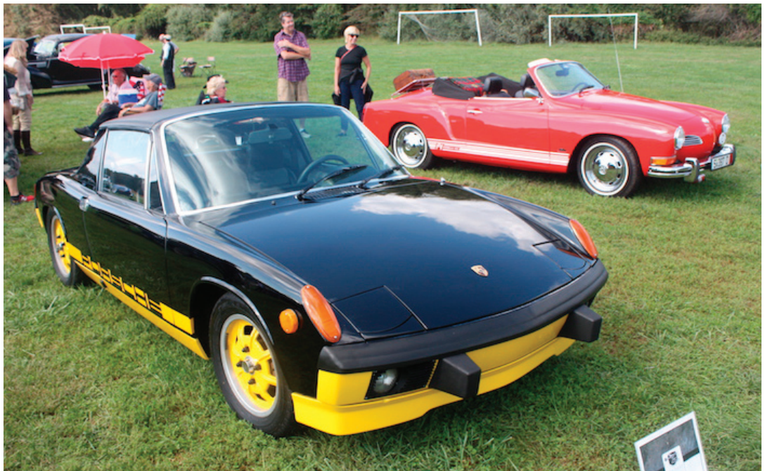
A 1974 Porsche LE and a 1974 VW Karmann Ghia were the newest cars at the 2018 New Jersey Concours d'Elegance.