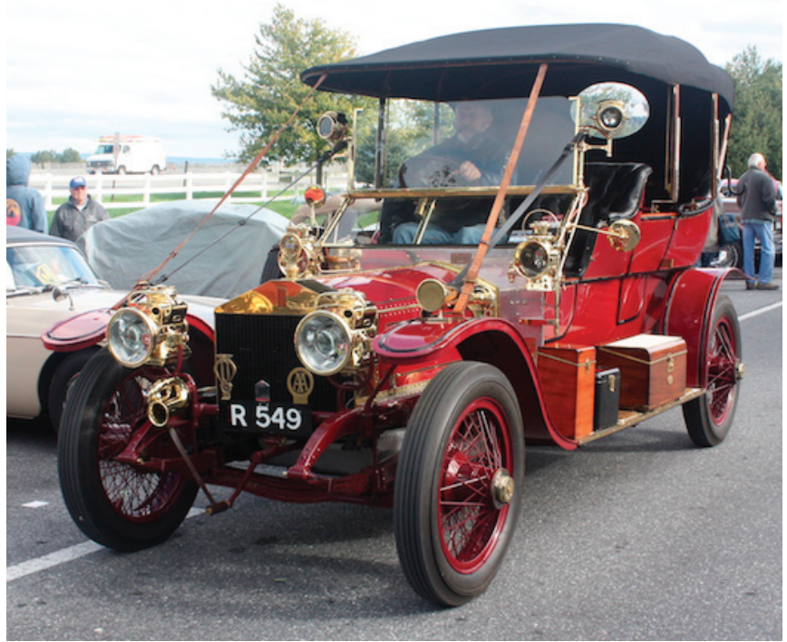
Above: This brass-era Rolls Royce ran so silently through the car corral. Perhaps it needed to dangle an empty soda can from its rear end to alert unwary strollers?

Some early rain on Saturday kept the show field from filling completely, but the sun came out along with plenty of interesting vehicles ranging from a WWI Packard army truck to a 1937 Buick Funeral Coach to a 1993 Jaguar XJR. There was no shortage of cars that reminded you of your past rides or stoked a wishful desire of owning one yourself. Throughout it all, we spent plenty of time together telling tales of our automotive escapades, learning something new, meeting old friends and making new ones.