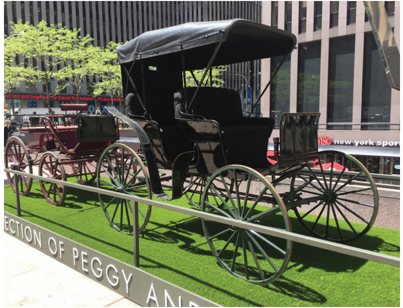
Rockefeller's carriages on display in his namesake neighborhood in NYC ahead of their sale.

So how did these do? Incredibly, the estimates of all three were way off. The Surrey and T-Card each sold for $81,250. The much older Phaeton crushed it with a realized price of $225,000! Clearly, more than one buyer showed up wanting these wheels. Speaking of wheels, the hubs on the phaeton say "A.T. Demarest & Co. N.Y. 5th Ave, & 33d St." These have to date from after 1890, when they moved there from Broadway & Bleecker, so appear to be replacements. Like most carriage makers, Demarest evolved to make custom automobile bodies for such marques as Renault and Benz, plus do repair work for LeBaron.