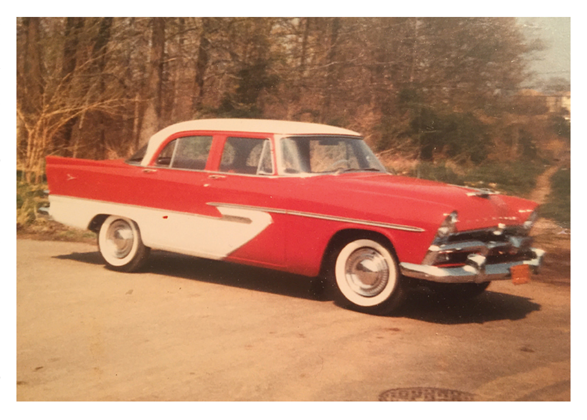
The Belevedere name originated as the designation of a two door hardtop on the Plymouth Cranbrook in 1951. In 1954, it replaced the Cranbrook as the top of the line Plymouth.