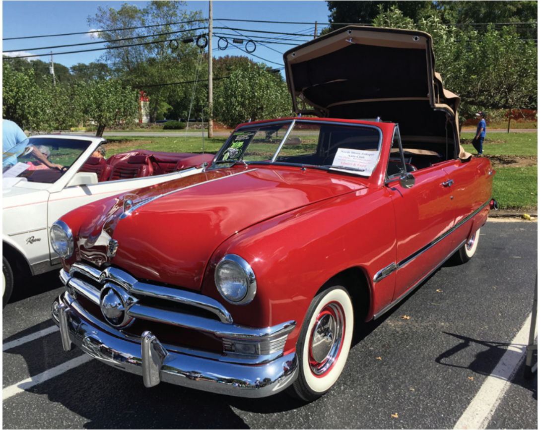
Top up or down, the '50 Ford shows off its "shoebox" form. One quick way to know a '50 from a '49 is the fuel filler door above the fender crease. The '49 had an exposed gas cap below the fender crease.