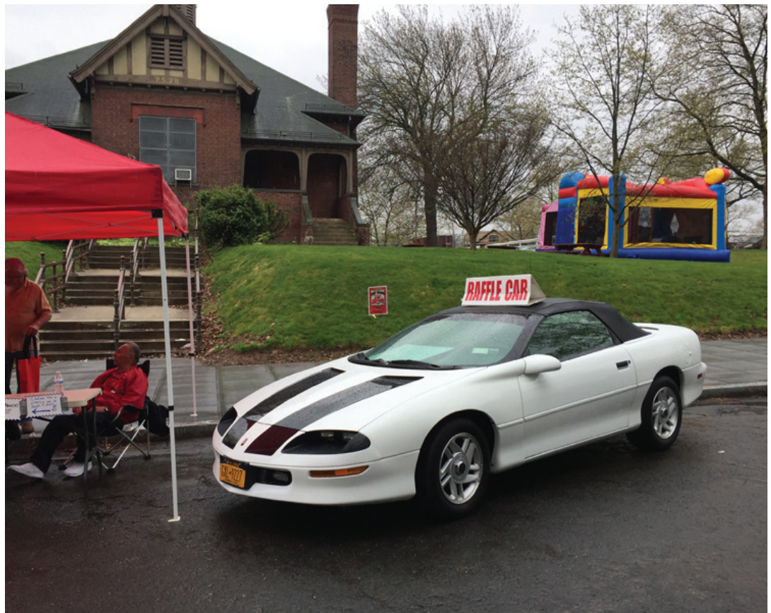
Far from convertible weather at the Chili Cook-Off