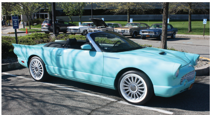
One car, representing two decades, nearly fifty years apart.