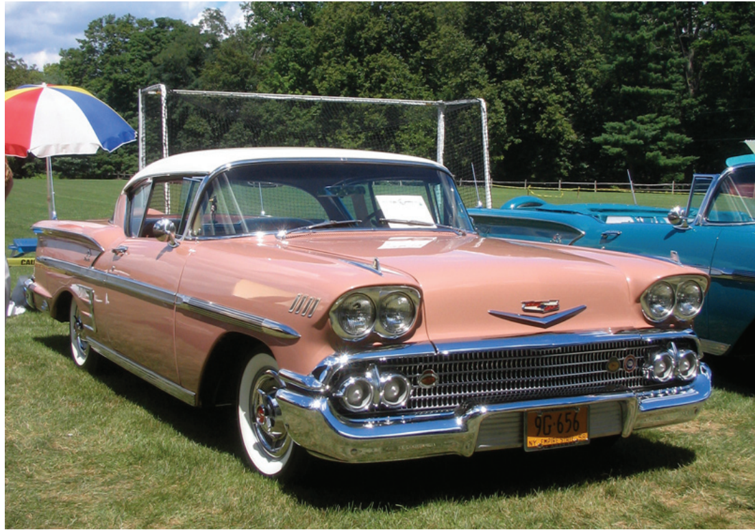
The car may have left the SIRAACA Garage, but its ghost will remain within its walls so long as we will remember it.