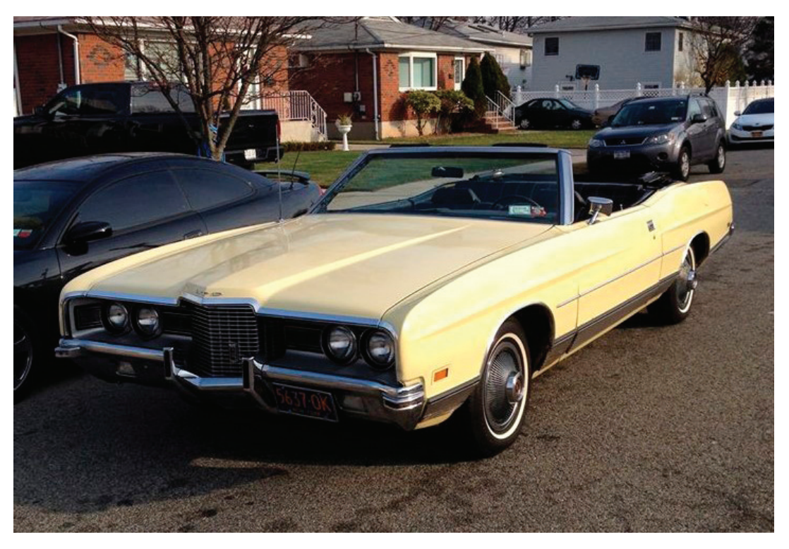
While Ford had some inventive color names in 1971, such as "Anti-Establish Mint", "Walnut Fire", and "Grabber Lime", their marketing folks couldn't nail them all. As best we can tell, Artie's LTD is "Yellow".