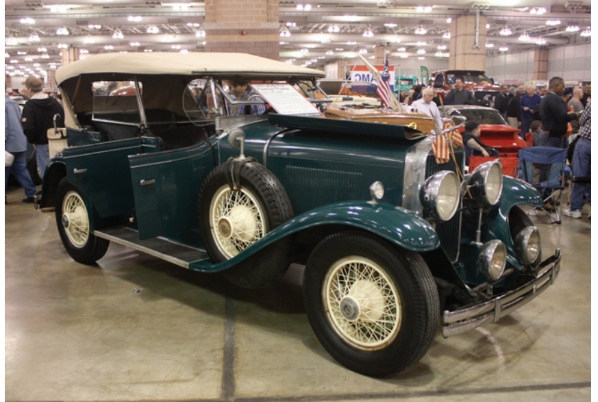
One of the few 1920's cars for sale in AC was this 1929 LaSalle Series 328 five-passenger phaeton (above). It was a good, solid example of either a well-preserved original car or a not-so-well-preserved older restoration. Either way, the owner was asking for $42,900. The 1978 Lincoln Town Car (below) was a Cartier Edition with only 9,282 original miles. It was a no-sale at a high bid of $9,750, or slightly more than $1.00 per mile.