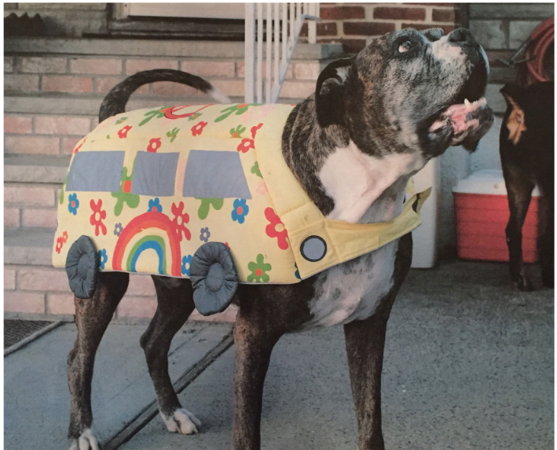
Four-legged friends can like four-wheels just like us car guys. In fact, Zeus decided to dress up like a four-wheeler in this picture, sporting a 1960's flower-power van costume.