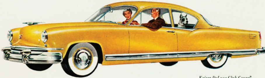
Kaiser DeLuxe Club Coupe*