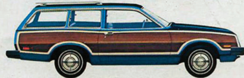
Pinto Squire Wagon,* Bright Blue (3J)