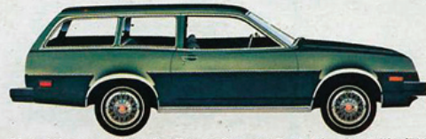
Pinto Wagon w/ Exterior Decor Group,* Dark Pine Metallic (7M)