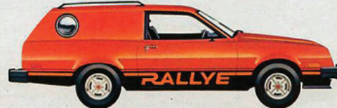
Pinto Wagon with Rallye Pack,* Bright Bittersweet (2G)