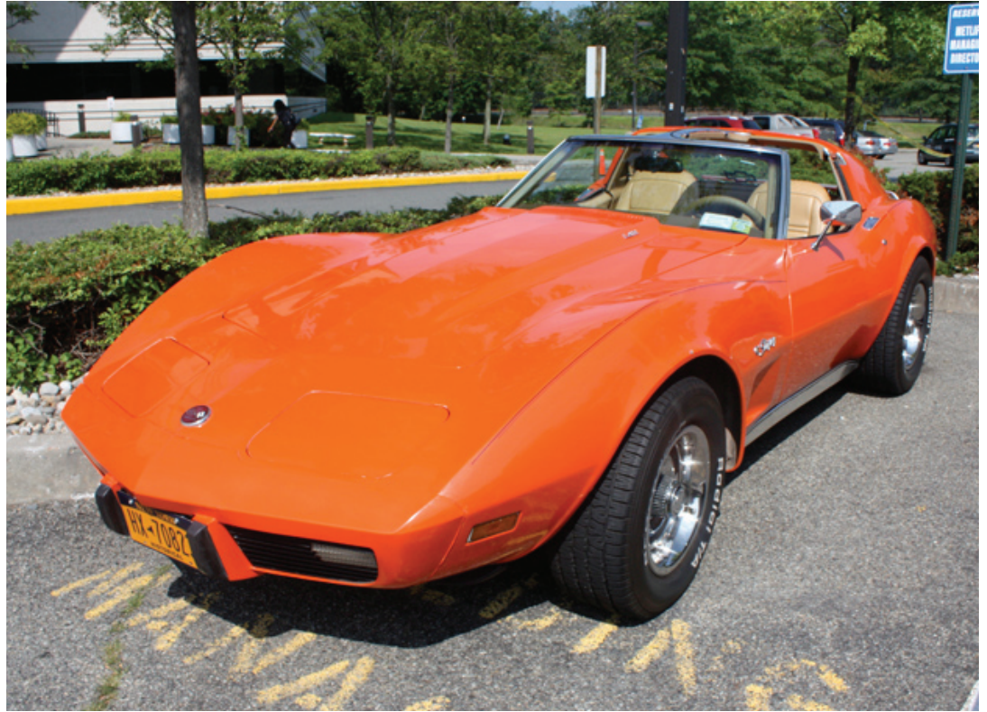
Web research indicates this color is known as Orange Flame, which adorned slightly less than 10% of the 46,558 Corvettes built in 1976.

Do you have (or had) a car that you'd like featured in the SIRAACA Garage? This includes your first set of wheels, when today's old cars were new. If so, please send pictures and details to Paul Jr. via parena2@verizon.net , or see him at one of our monthly meetings.