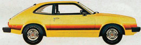
Pinto 3-Door Runabout with Cruising Package,* Bright Yellow (6N)