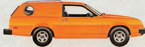
Pinto Wagon Cruising Package without graphics,* Bright Caramel (5T)