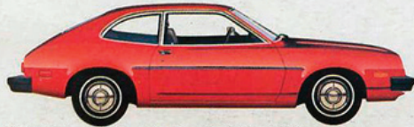
Pinto 2-Door Sedan, Medium Red Glow (2H)