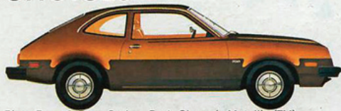
Pinto Pony 2-Door Sedan, Dark Chamois Metallic (7M)