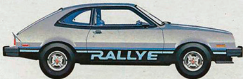
Pinto 3-Door Runabout with Rallye Pack,* Silver Metallic (1G)