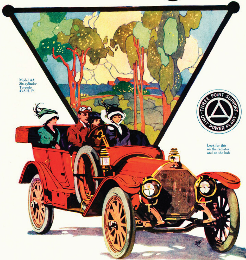
Model AA Six-cylinder Torpedo 43.8 H. P.