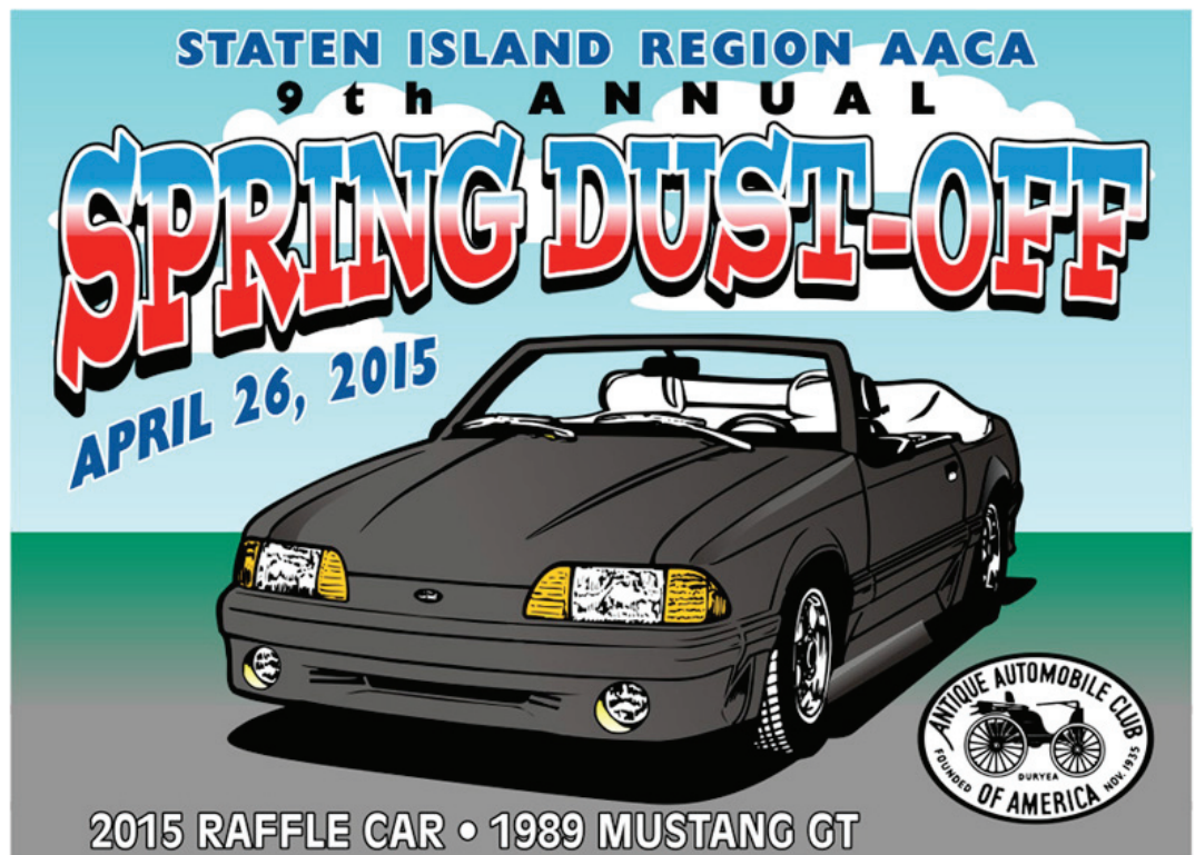
2015 RAFFLE CAR • 1989 MUSTANG GT

The club will host it's 9th Annual Spring Dust-Off at The College of Staten Island on April 26th. Final plans for members and their responsibilities will be ironed out at the April meeting, which will be held on April 14. While there is no class judging at the Dust-Off, we will present special awards such as Best in Decade and Best In Marque. A small group of members will work the field to spot candidates before final selection. The winners will drive up to the red carpet to receive their awards. We will need people covering the car and spectator gates, and others to help with the raffle table. Please make every effort to attend the April meeting and be available for our show as well.